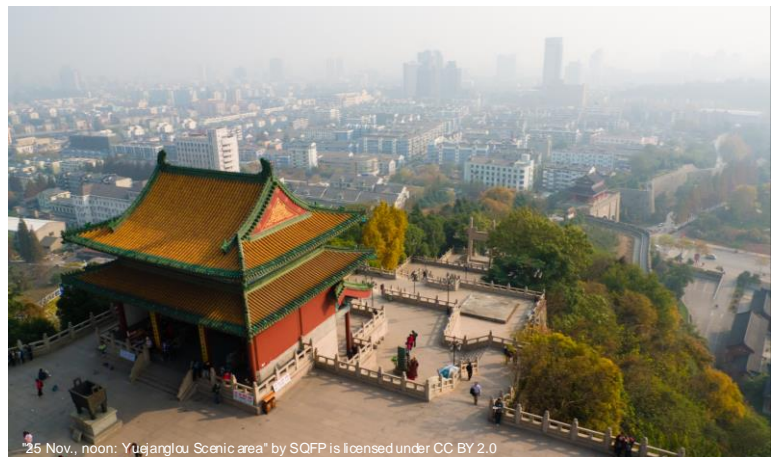
"25 Nov., noon: Yujanglou Scenic area"